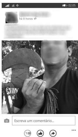
Figure 1. The Kàjre on Facebook

The Krahôs have been accessing digital social networks since 2013. Access is done by cell phone in the city of Itacajá, Tocantins, or in the village Manuel Alves, from where the signal comes. One can see how easily they find themselves in the digital environment. Figure 1, reveals the mēkarô of the hatchet and exposes the Kàjre, which, when digitized, changes substance. She goes through a digital transubstantiation.